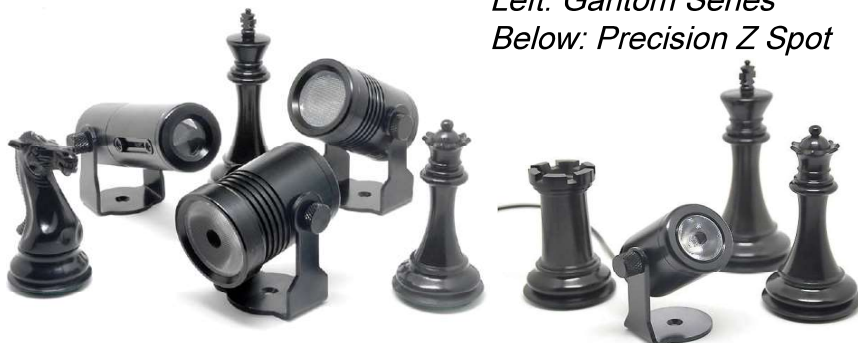
Left: Gantom Series Below: Precision Z Spot