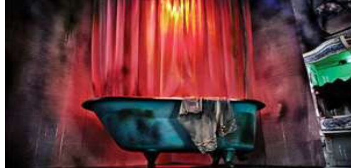
The Nest in Arizona using Precision DMX fixtures

Previous installs include The Nest in Arizona, Lotte World in South Korea, and Colorado's very own Lost River of the Pharaohs at Water World!