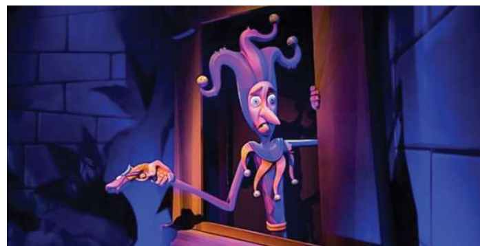
Lotte World in South Korea